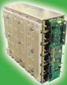
DC/DC CONFIGURED PRODUCT with proven electrical & coolant sub-systems