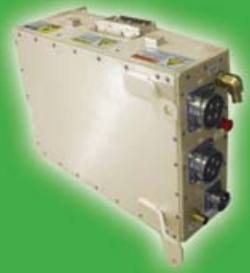
TAILORED SYSTEM Unique mechanical configuration