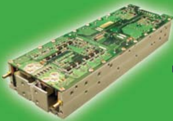
STANDARD POWER MODULE BUILDING BLOCK